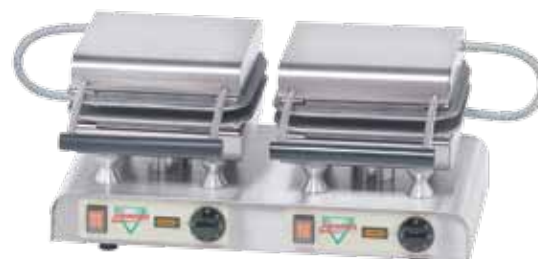
Double Version also available