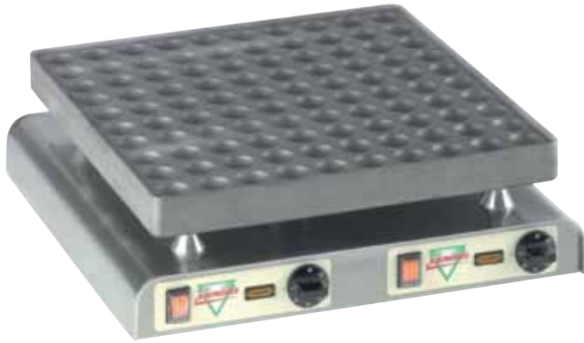
100 trough unit