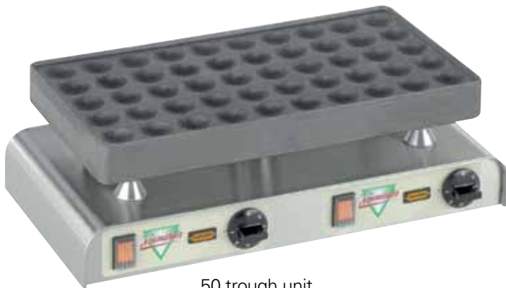
50 trough unit