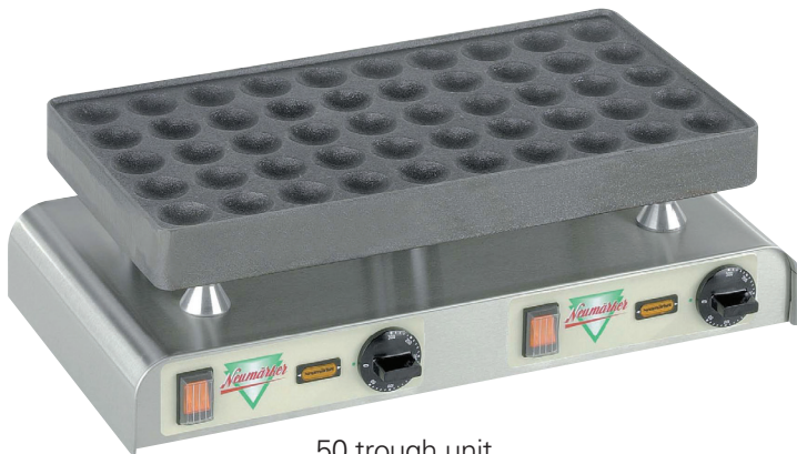
50 trough unit