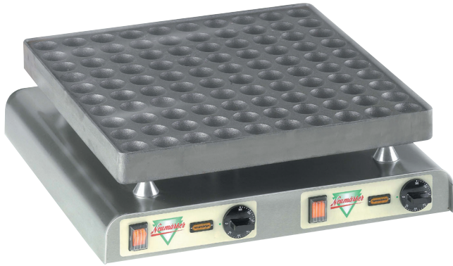
100 trough unit